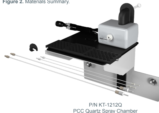
Figure 2. Materials Summary.