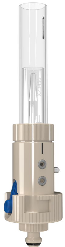
E-Torch for Thermo Scientific® PRO DUO