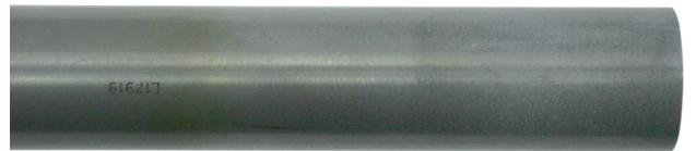
Ceramic outer tube

A combination of high temperature and salt deposit causes a quartz torch to devitrify. Higher concentrations of salt in the samples lead to more rapid devitrification. The quartz torch in the photo was run for only 6 hours with samples containing 10% NaCl and is already badly degraded. By contrast, the ceramic material does not devitrify and is not affected by salt deposits.