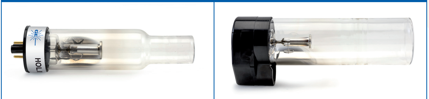
2inch (51mm) Lamp: