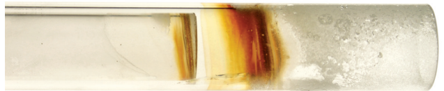
Quartz outer tube